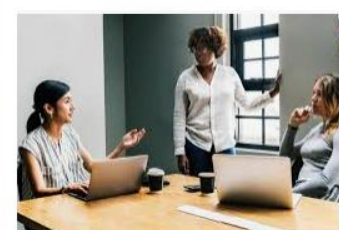
MedLIT: A new course for migrant women ... cesie.org