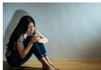
Migrant women are particularly ... phys.org