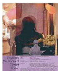
Visualizing the Voices ... voicesofwomenmedia.org