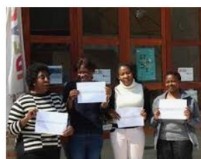
Migrant women, asylum seekers and ... cesie.org