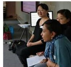
Visualizing the Voices of Migra... voicesofwomenmedia.org