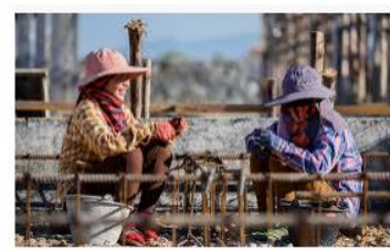
Putting the Spotlight on Women Migrant ... ourworld.unu.edu