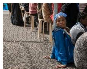
Who's responsible for violence against... opendemocracy.net